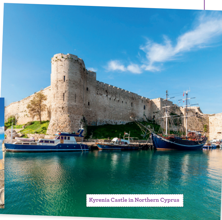
Kyrenia Castle in Northern Cyprus