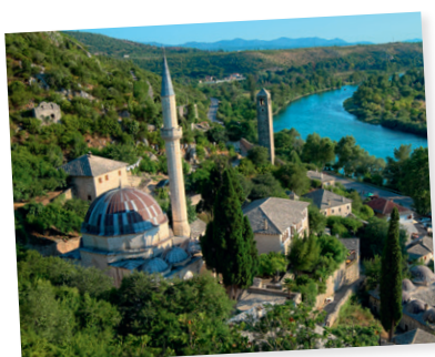
Above: Počitelj fortified town, Bosnia and Herzegovina Below: the library of Celus, Ephesus, Turkey

Journey to the kingdom of Jordan and discover the most spectacular of treasures. Stand in awe at the architectural triumph of Scandinavia's Öresund bridge or explore some of Europe and Asia's most fascinating UNESCO World Heritage Sites. In fact, why not make 2024 your year of culture?